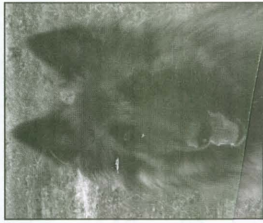
Cotab's Count Monte Cristo (Cris)